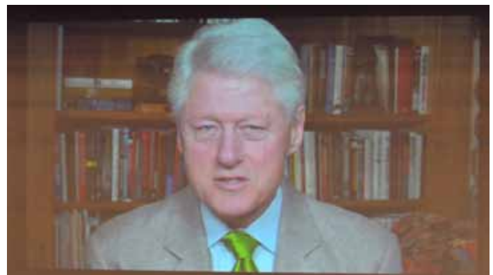
Former US President Bill Clinton spoke to the session via taped video

In a video message, former US President Bill Clinton, Clinton Foundation, praised Forest Day for showcasing research on forests and climate change, noting that policy-makers need to have access to facts, options and support from different constituencies in addressing REDD. He cautioned that new policies should not put the lives of forest-dependent people at risk, but rather support them in adaptation. He underscored the need to act quickly to conserve forests to achieve global and local benefits.