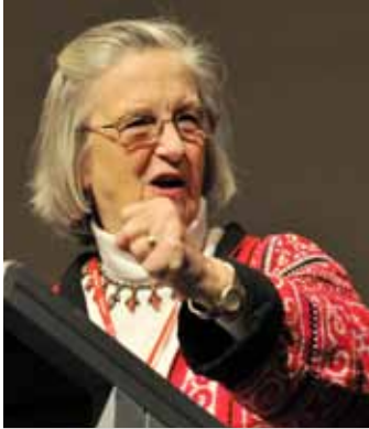
Elinor Ostrom, Indiana University

Elinor Ostrom, Indiana University, shared research findings pointing to a strong link between increased forest carbon storage and situations in which local communities have rule-making independence, harvesting rights and a role in monitoring. She called for a carefully designed and adaptive