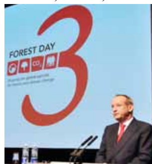
Yvo de Boer, UNFCCC Executive Secretary