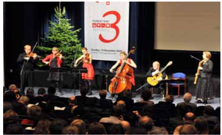
A local orchestra performed at the beginning of the opening plenary

FOREST DAY 2: Forest Day 2 brought together nearly 900 participants in Poznan, Poland, on 6 December 2008, during COP 14, to discuss: adaptation of forests to climate