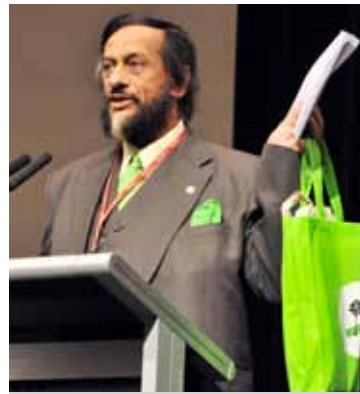
Rajendra Kumar Pachauri, IPCC Chair