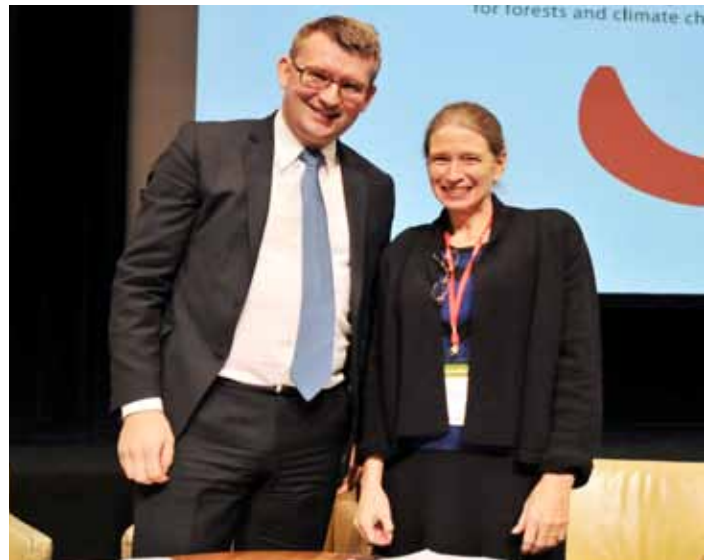
L-R: Troels Lund Poulsen, Minister for the Environment, Denmark; and Frances Seymour, Director General, CIFOR