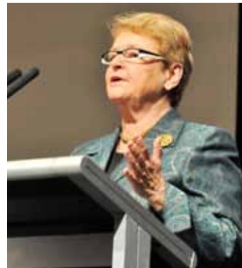
Gro Harlem Brundtland, UN Special Envoy on Climate Change

Congress' message to COP 15 identified as prerequisites for SFM: improving governance, increasing financing, empowering marginalized groups and providing better access to technology. He noted that climate change has created new opportunities for the forest sector, but solutions need to build on the knowledge and experience of stakeholders that manage and depend on forests.