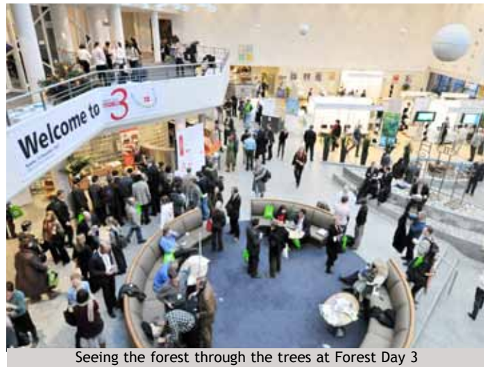
Seeing the forest through the trees at Forest Day 3

In its Fourth Assessment Report, the Intergovernmental Panel on Climate Change (IPCC) calculated that about 20% of anthropogenic carbon dioxide emissions during the 1990s resulted from land use change, primarily deforestation, although 25% of total emissions are also estimated to have been absorbed by terrestrial ecosystems. Depending on the age of the forest, the management regime, and other biotic and abiotic disturbances (insects, pests, forest fires), forests can act as reservoirs, sinks (removing greenhouse gases (GHGs) from the atmosphere) or as sources of GHGs. Forests also provide a number of vital services, notably as repositories of biodiversity and regulators of the hydrological cycle. Reducing deforestation and land degradation and improving forest cover are vital for both mitigation and adaptation. However, including emissions reduced from forest-related activities in a carbon accounting system is complex undertaking, given the non-