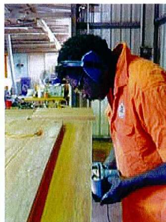
The Gumatj people of east Arnhem Land are building a sustainable timber industry which includes harvesting and milling timber, housing construction, furniture making and training.

"It was an amazing environment for real cultural exchange and learning," Jane said. "Many people visited our tent and were very interested in what the